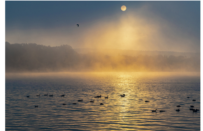
Morning coffee Certificate of Merit Jay Kuntz