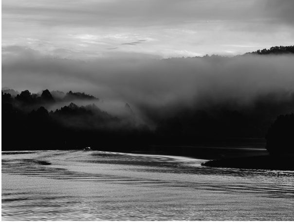
what does the future hold? Certificate of Merit Larry Cox