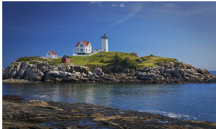
Looking Over Calm Waters Certificate of Merit Bill Shissler