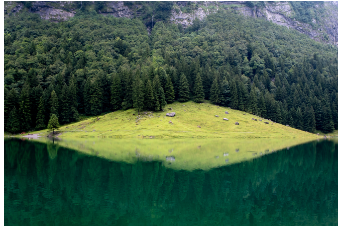
Seealpsee Reflection Certificate of Merit James Moore