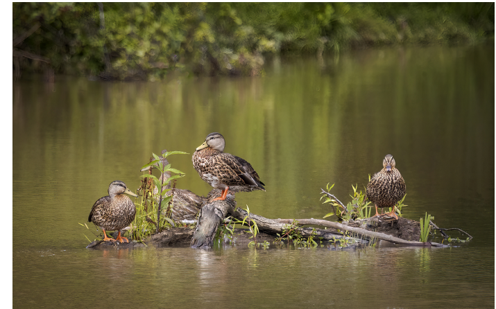
High Water Refuge Certificate of Merit Bill Shissler