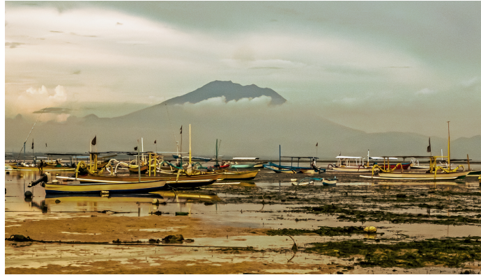
Sanur Beach Bali Certificate of Merit Thomas Trempus