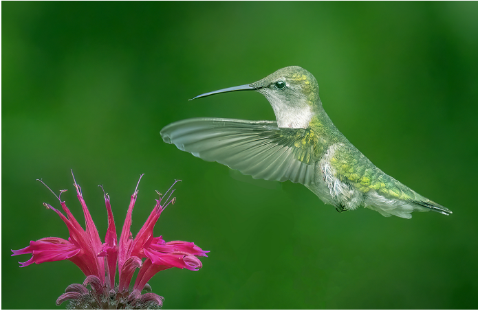
Diving In - Hummingbird Certificate of Merit Bill Shissler