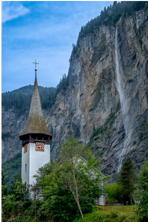
Staubbachfall Certificate of Merit James Moore