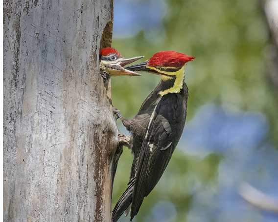
Hungry Mouths to Feed Certificate of Merit Bill Shissler