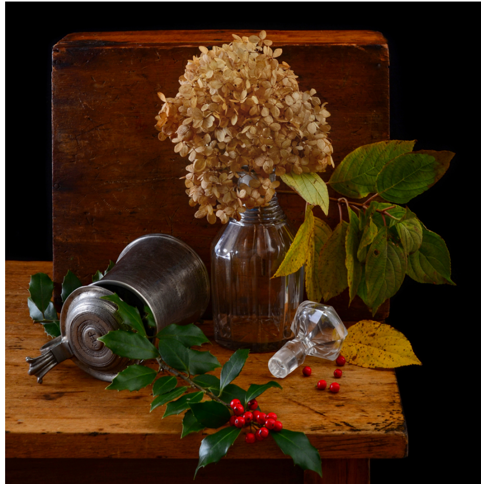
Ode to Autumn Certificate of Excellence Nancy Koch