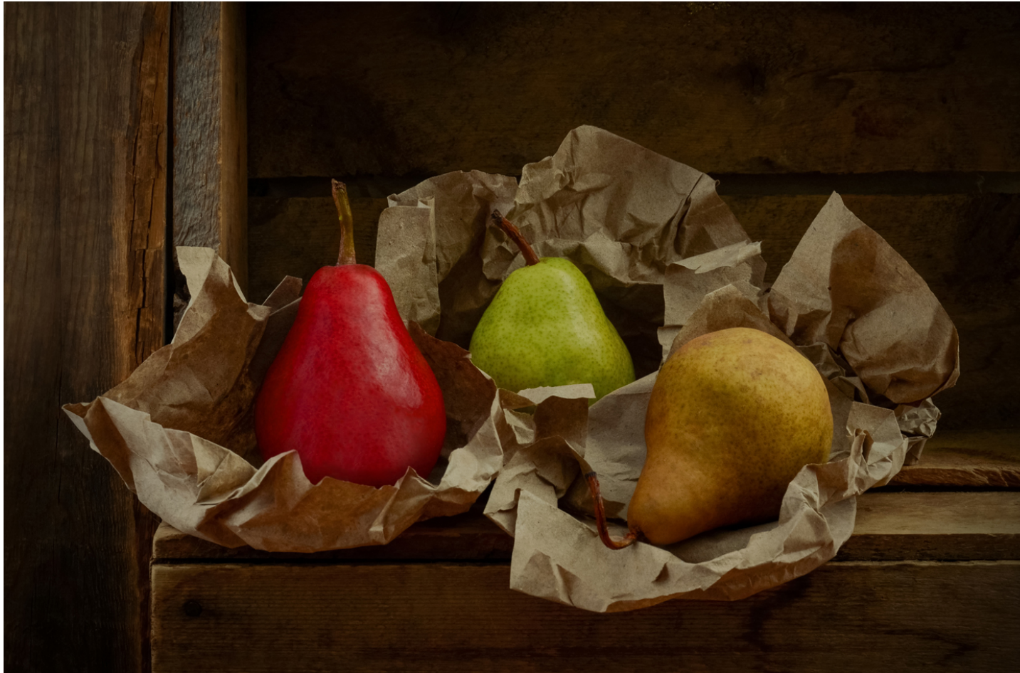
Packing Pears Certificate of Excellence Nancy Koch