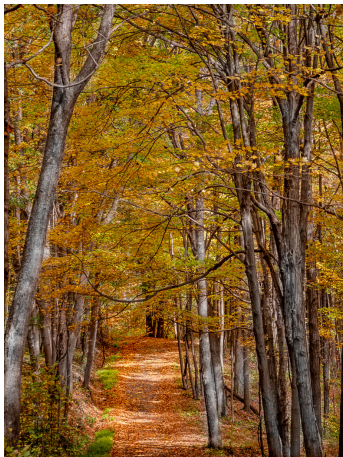
Silver and Gold Certificate of Merit Larry Cox